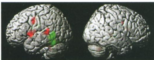
Green areas of the brain are significantly less active in dyslexics compared to normal individuals when reading simple words.